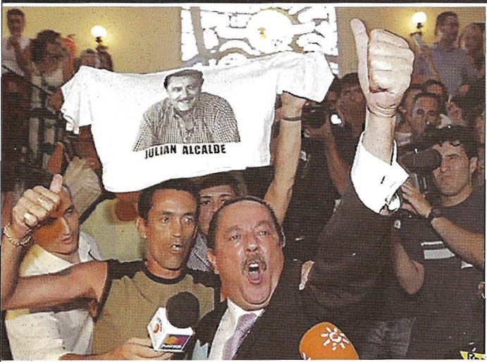
Muñoz seizes control of the city

“ Roca is believed to have stated, with some accuracy: ‘I am the town hall’ ”